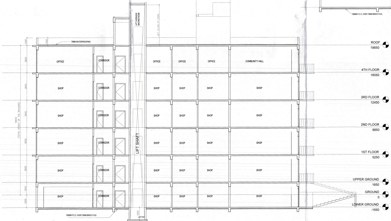
COMMERCIAL BLOCK SECTION GG'